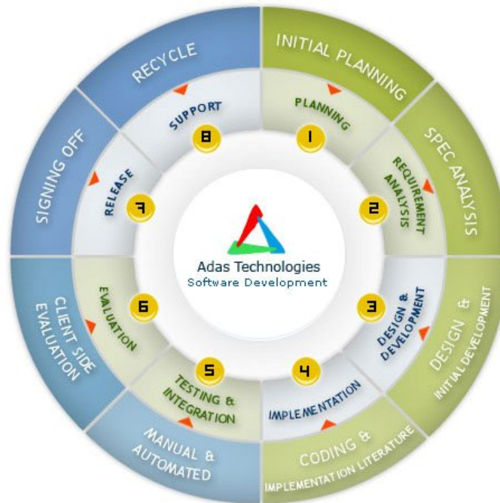
Figure 1: Adas Technologies Software Life-cycle methodology

Based on our discussions we understand your business needs. Adas Technologies promises a strong business foundation to deliver greater efficiency, sustain & improve compliance and deliver customer satisfaction, while meeting its key objectives around quality, accuracy, time and cost.